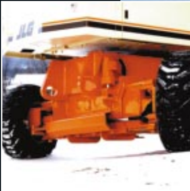
Oscillating Axle, Terrainability