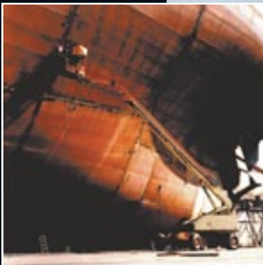
Proven Performance and Reliability