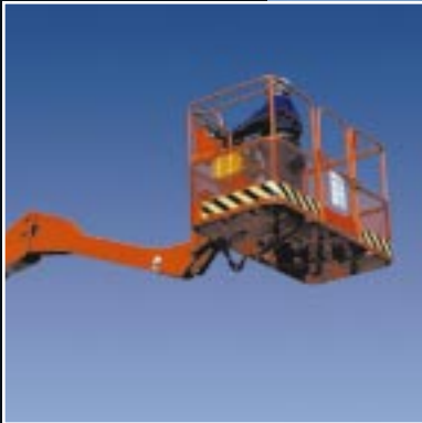
Extend-A-Reach for Added Versatility